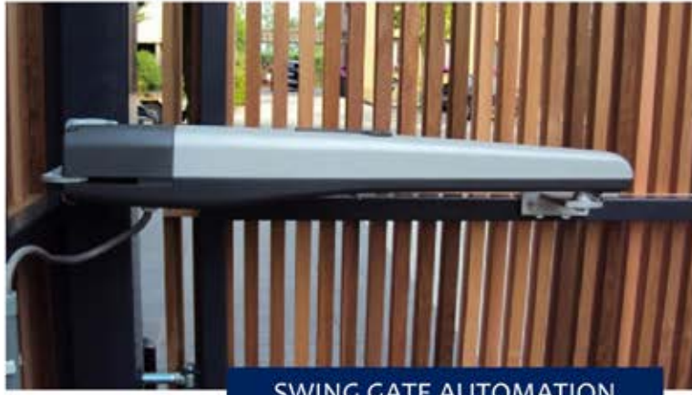
SWING GATE AUTOMATION