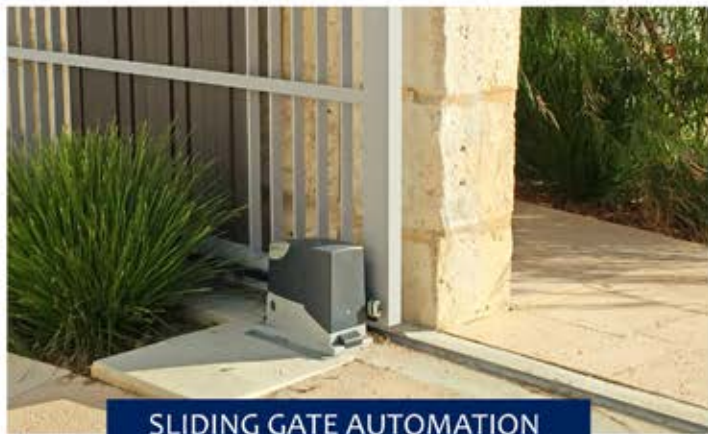
SLIDING GATE AUTOMATION